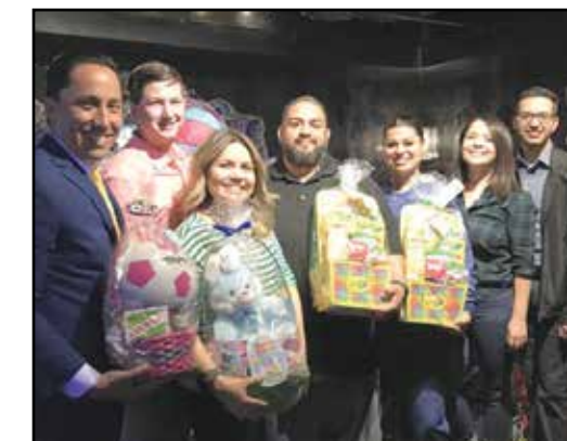
Todd Gloria's Easter Basket Drive with members of GenNext!

June 19, 2018 August 21, 2018 October 16, 2018 December 18, 2018 July 17, 2018 September 18, 2018 November 20, 2018