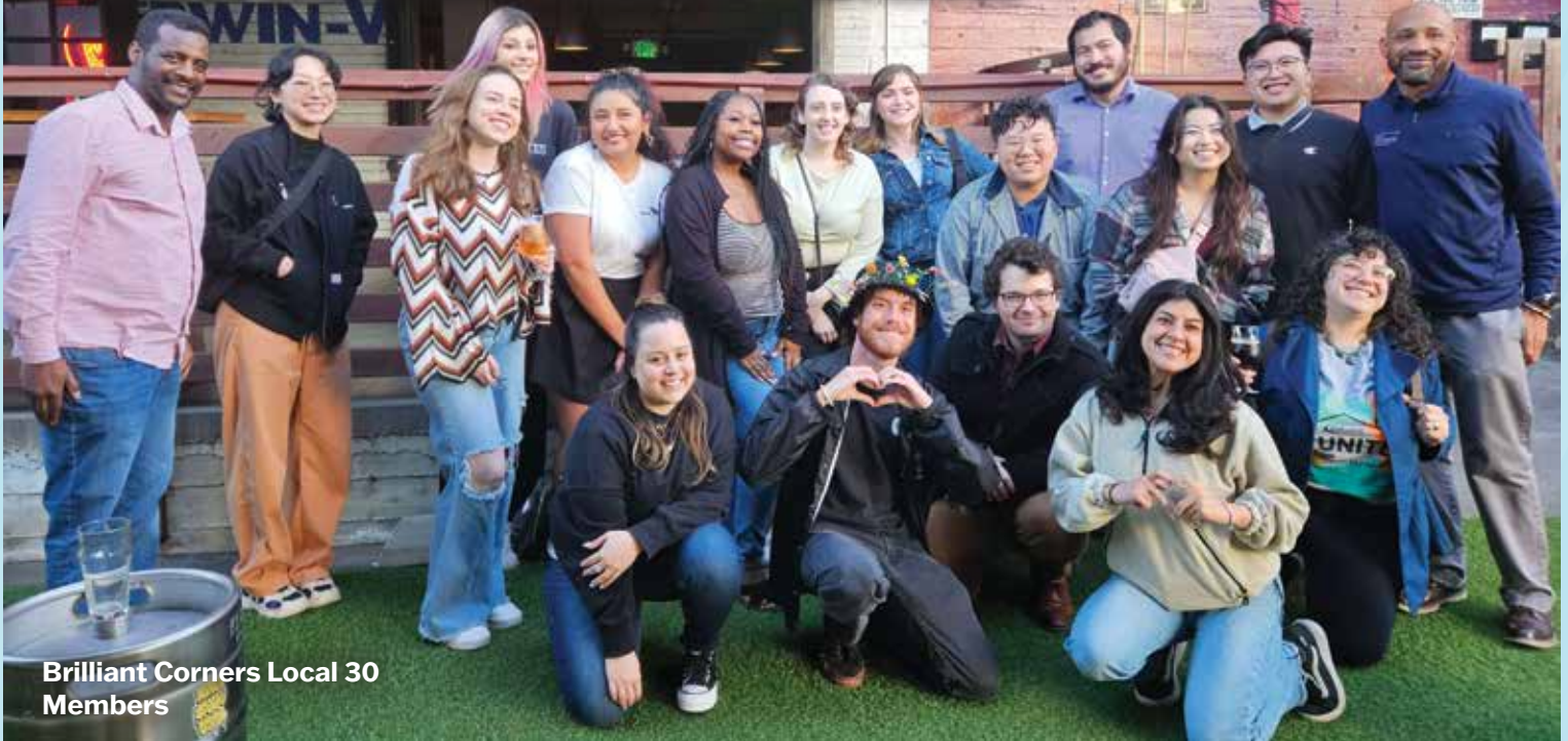
Brilliant Corners Local 30 Members

In our ongoing efforts to organize the unorganized and always make Local 30 bigger and stronger, please welcome our newest groups to our great Union.