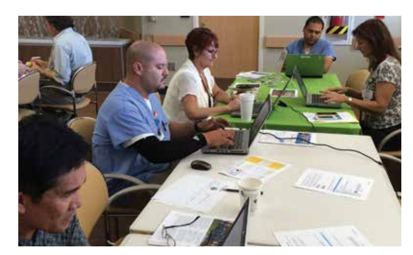
Staff at Zion completing their Total Health Assessment. We will be in the basement every Tuesday from 7 to 4. Come by

A potato will bake faster if the skin is rubbed in oil rather than being wrapped in tin foil.