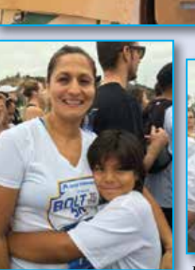
BOLT HO OUT A O