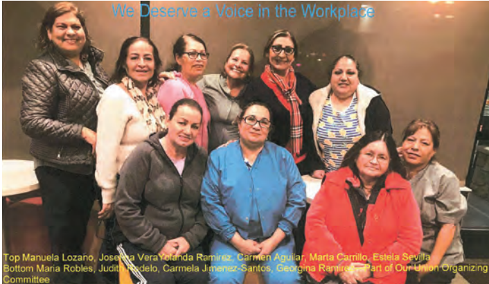
Sodexo Chula Vista EVS