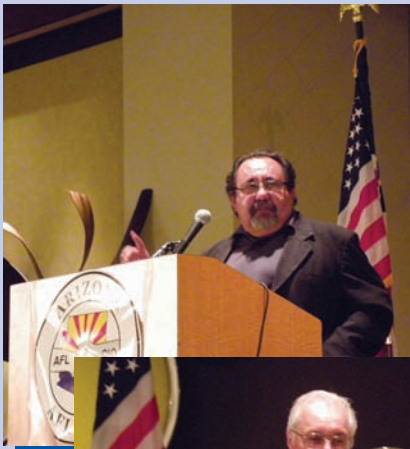
Congressman Raul Grijalva