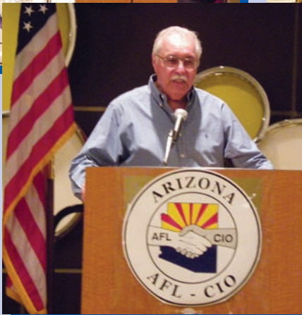
Congressman Ed Pastor