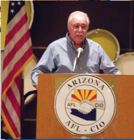
Congressman Ed Pastor