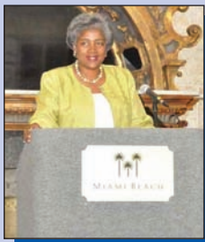
Donna Brazile, Guest Speaker

had a lump in my throat, as I reflected on all who came before us using various means of communications, including the Underground Railroad for Freedom & Justice. Needless to say it was a powerful and uplifting experience that I will always carry near and dear to my heart.