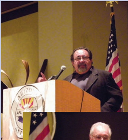
Congressman Raul Grijalva