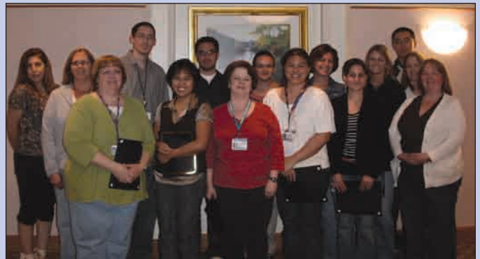
National Services Line of Business

Local 30 recognizes the California Service Center on their extraordinary success in exceeding the 2007 Regional goal for attendance.