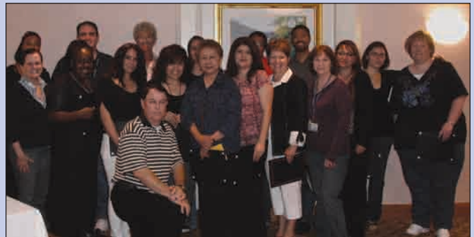
DPA/SBA/MRN Line of Business