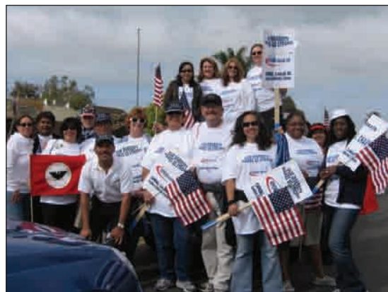
Cesar Chavez Parade Saturday, March 29, 2008