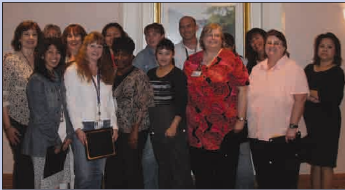
Large Accounts Line of Business