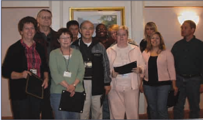
Operational Support Line of Business