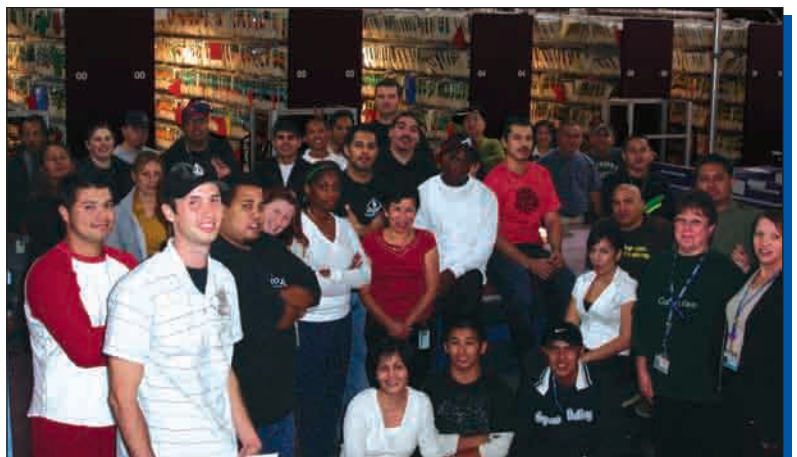
Medical Office Records Department Work Place Safety

Congratulations to the Medical Office Records Department Work Place Safety Team in achieving, for the first time, 99 days without injuries. Great job!!!