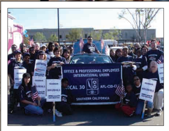
Martin Luther King Parade January 19, 2008