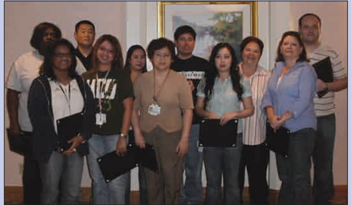
Special Accounts Line of Business