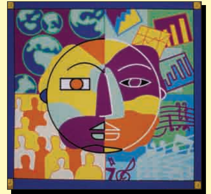
KP Diversity Logo

This conference reflects the landmark achievements of Kaiser Permanente as an organization and their extraordinary commitment to diversity and inclusion, which is captured in the theme "Three Decades of Diversity: From Mandate to Mission."