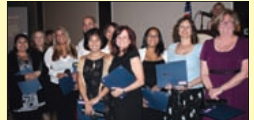
CSC Attendance Team